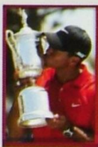
U. S. Open 2006