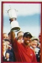
U. S. Open 2000