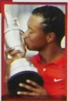
British Open 2006