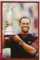
British Open 2005