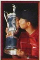
U. S. Open 2002