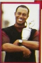
British Open 2006